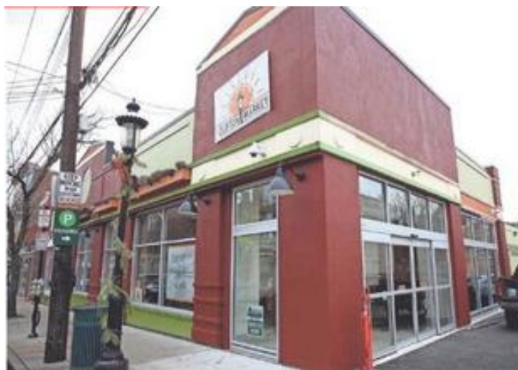
Clifton Market on Ludlow Avenue is scheduled to open Sunday. Eighty-one jobs are being created with the opening of this new grocery co-op that was once home to Keller's IGA from 1939 to 2011.